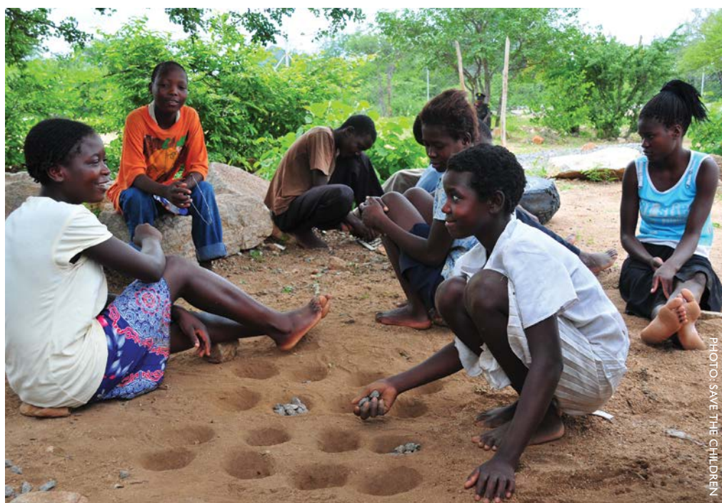
Children at a reception centre in Zimbabwe for unaccompanied children who have been deported from South Africa.