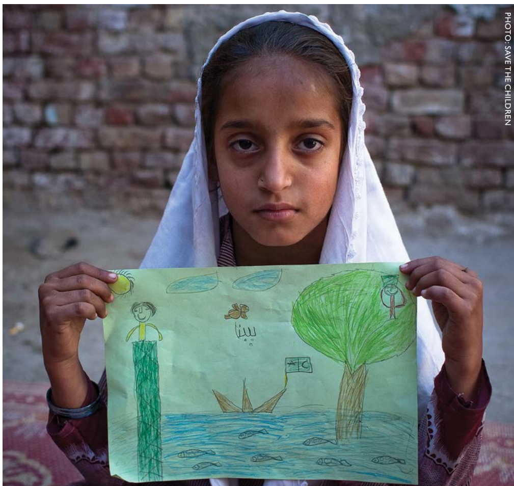
A girl holds up a drawing of what happened when her home in Pakistan was flooded, leaving her and her family stranded for days.