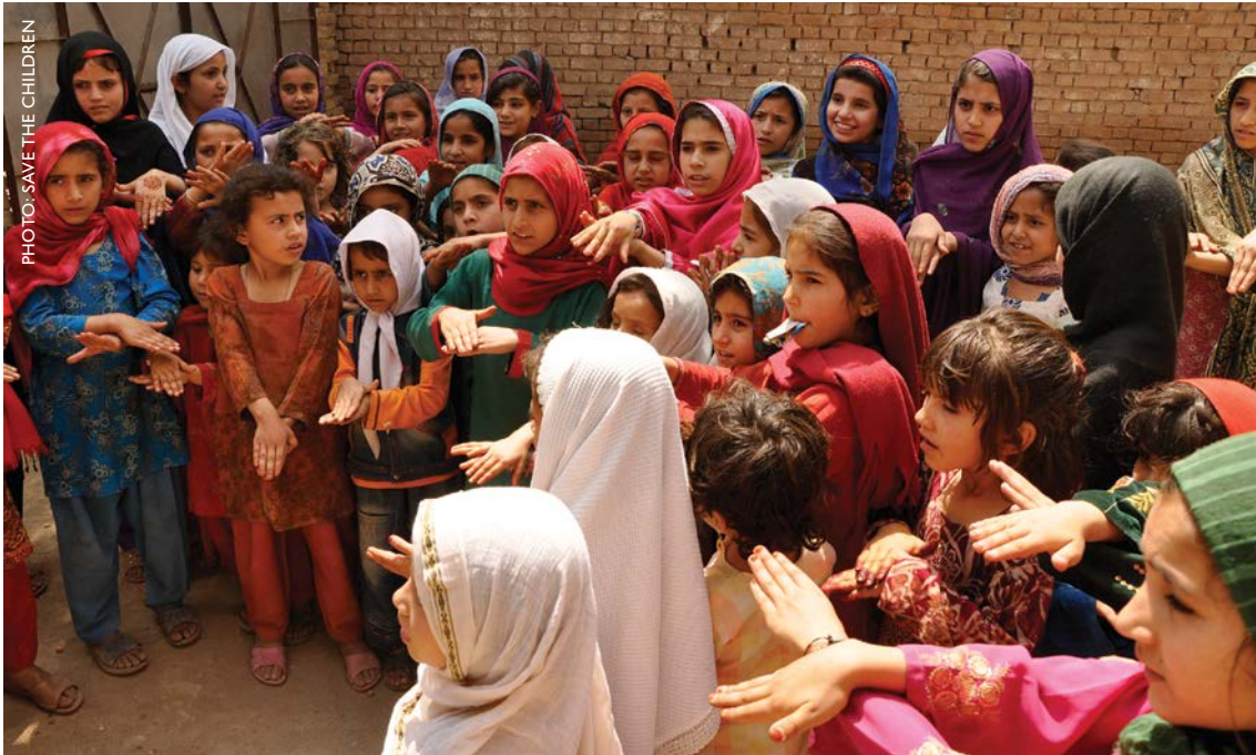
Girls at a temporary learning centre for displaced children in Peshawar district, Pakistan.