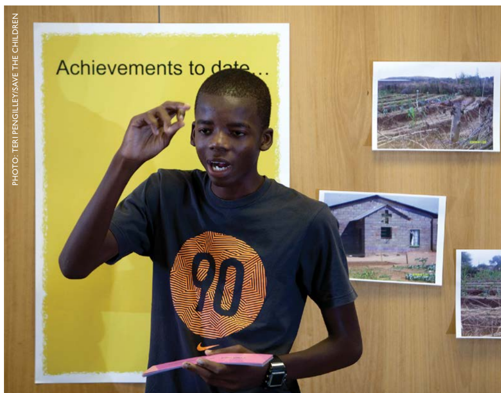
A workshop for members of Save the Children's global children's panel.