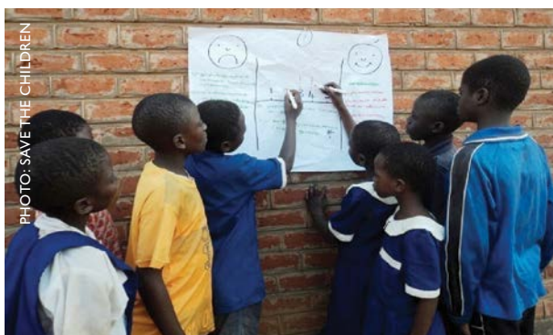
An H assessment activity, Malawi.