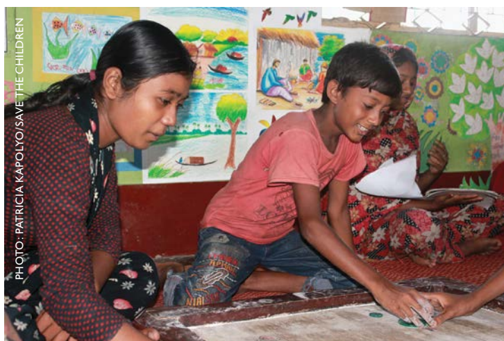
A centre for working children in Khulna, Bangladesh.