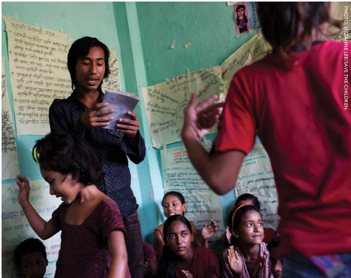
A children's club in Surkhet district, Nepal.

Thanks to The Article 15 Project for sharing some of their cartoon images from the Article 15 Resource Kit, which can be downloaded from CRC15.org . The images were created using BitStripsforSchools.com .