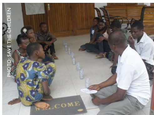
A 'Pots and stones' activity, Togo.