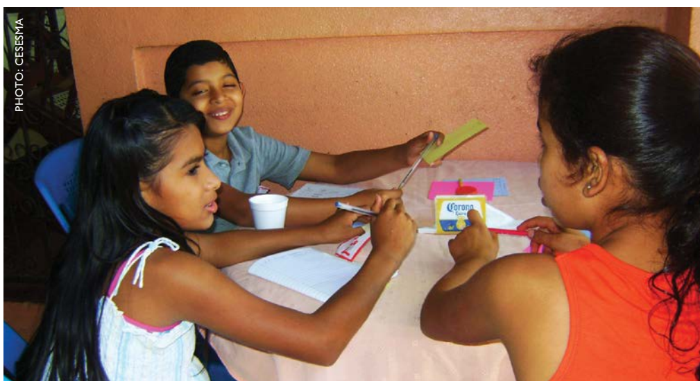
Children participating in a focus group as part of an M&E project baseline process in Walala, Nicaragua.