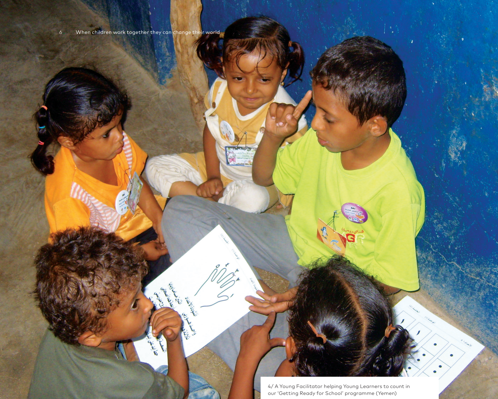
4/ A Young Facilitator helping Young Learners to count in our 'Getting Ready for School' programme (Yemen)