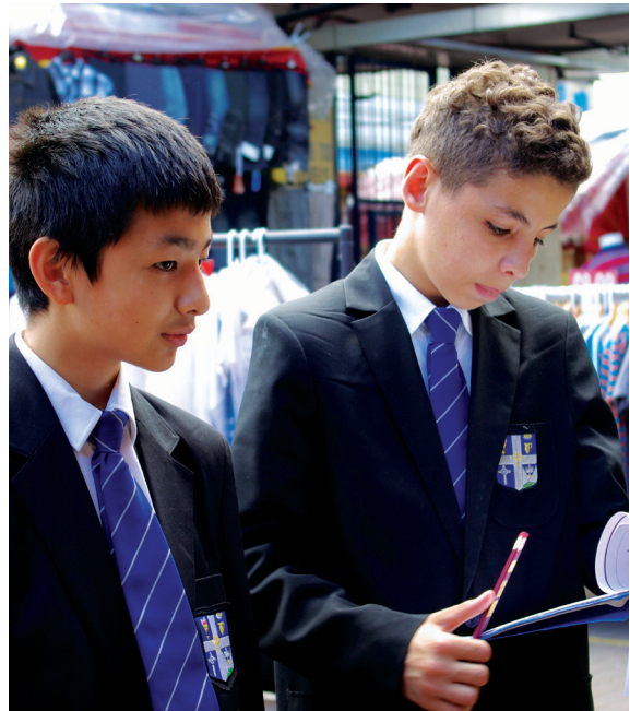
5 / Boys carrying out survey on community safety at the local market (UK)